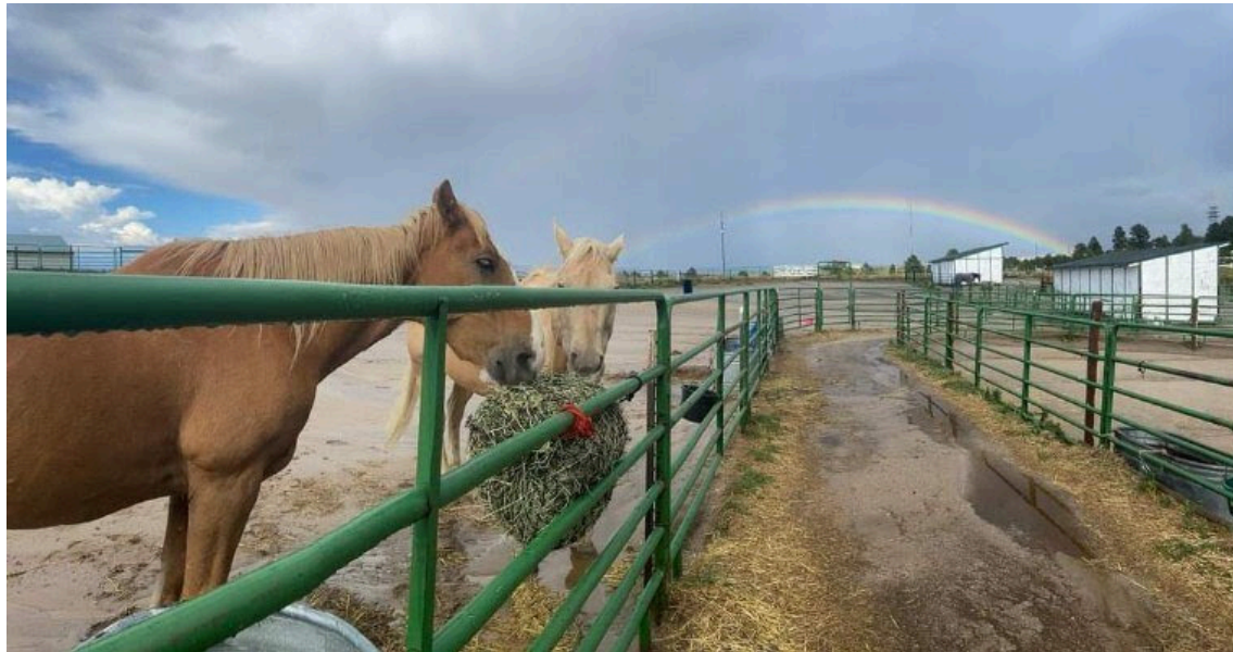
"Unbridled Possibilities" Pictured: Dusty and Sugar The Ranch Under a Rainbow